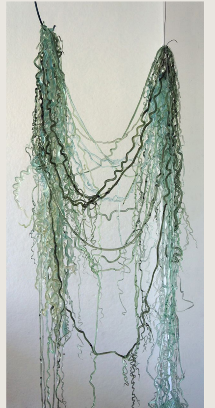
Kim Waale, Rivers , 2013 (detail) rubber, metal, variable dimensions.

In a nearly opposite way to Mary Giehl's microscopic view, Waale recreates models of rivers based on maps (originally created using macroscopic, aerial views) to reveal falsehoods in our attempts to capture nature. To insure the viewer doesn't regard the sinuous streams as accurate depictions of the natural world, Waale suspends the rivers in hanging clumps that recall Eva Hesse's suspended forms of the 1960's. Their seemingly freely-drawn, expressive lines are actually painstakingly copied from enlarged maps and carefully cast in durable, pliable rubber. This ironic sense of materials and process is something Waale has used effectively before as in a recent realistic, super-sized spider web fashioned from hand-spun kitchen plastic wrap.