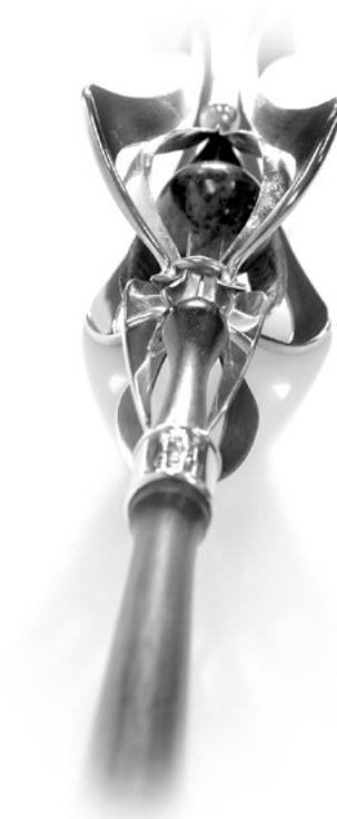
The University Mace

Thank you to my amazing family, friends, and professors. I couldn't have done this without your constant encouragement and support!