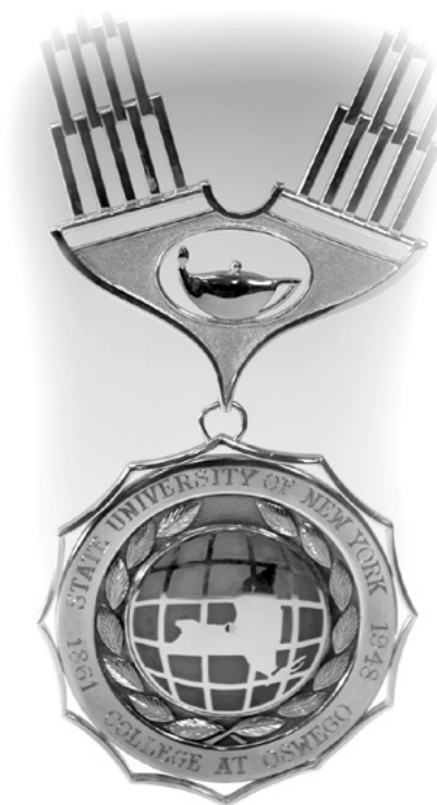
The University Medallion

Consistent with the university’s values of diversity and equity, inclusion and social justice, this acknowledgment demonstrates a commitment to cultivating relationships with Native American communities through academic collaborations, partnerships, historical recognitions, and community service in order to dismantle the legacies of conquest and colonization.